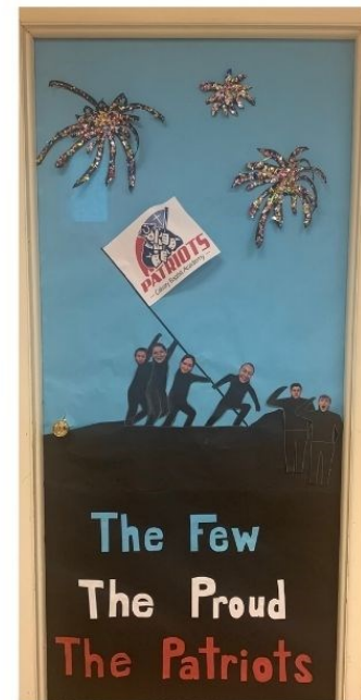
11th/12th Door Decor Contest WINNER