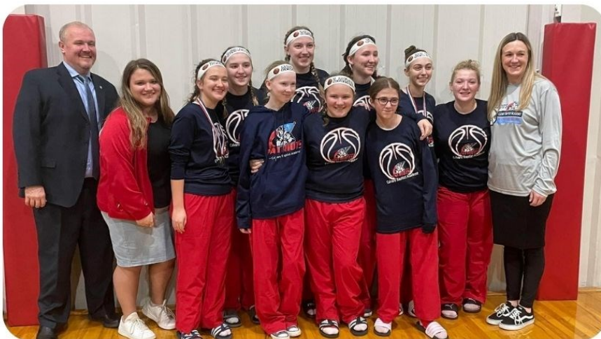
CONGRATULATIONS!! Lady Patriots

CBA families mark your calendar for Friday, May 12. We have some exciting news to share and it includes each CBA family. Details will be available soon.